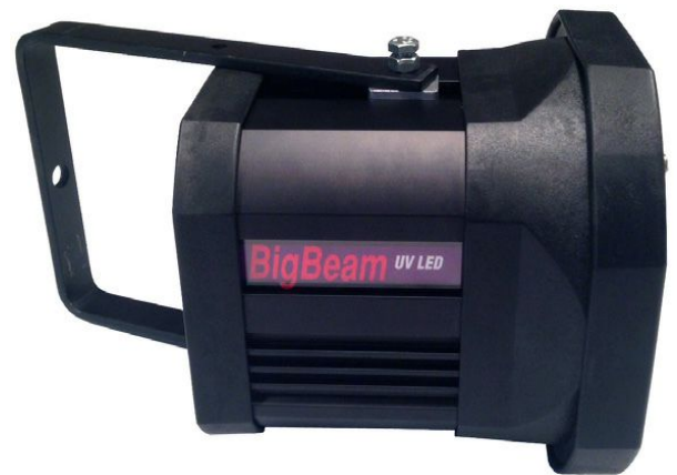
F800 & F801 U-Shaped Mounting Yoke & Mounting Lugs