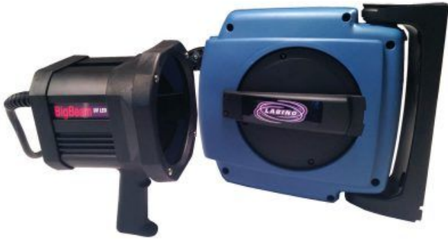
F175 Cable Winder