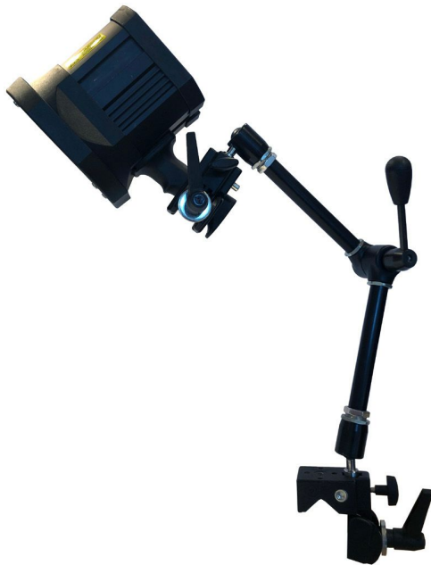
A530 Variable Friction Arm